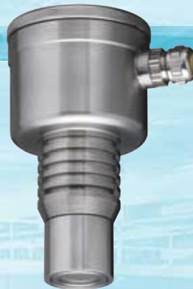
Model 8000-Range-W with diam 33 mm weld-on nipple.

Specifications can change without notice