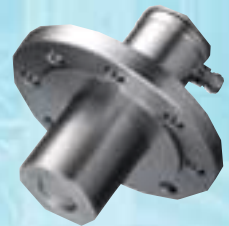
Level transmitter with extended diaphragm