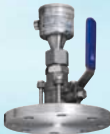
Level transmitter with special ball-valve