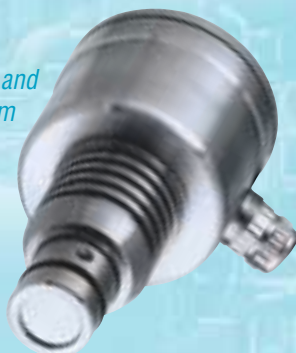
Strong flush and flat diaphragm with code W connections (from 1 bar and up).