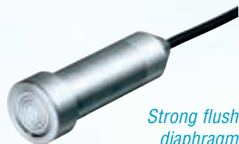
Strong flush diaphragm

For level measurement in open basins, concrete bunkers, etc.. Klay manufactures a range of submersible leveltransmitters with cable or SS extension, series "Hydrobar"