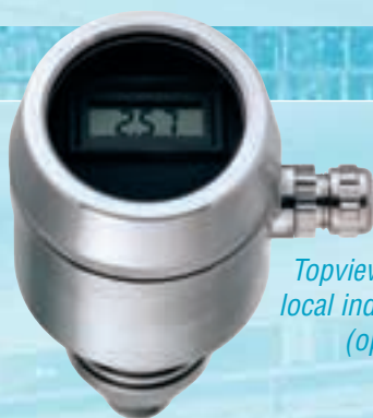
Topview with local indicator (option).