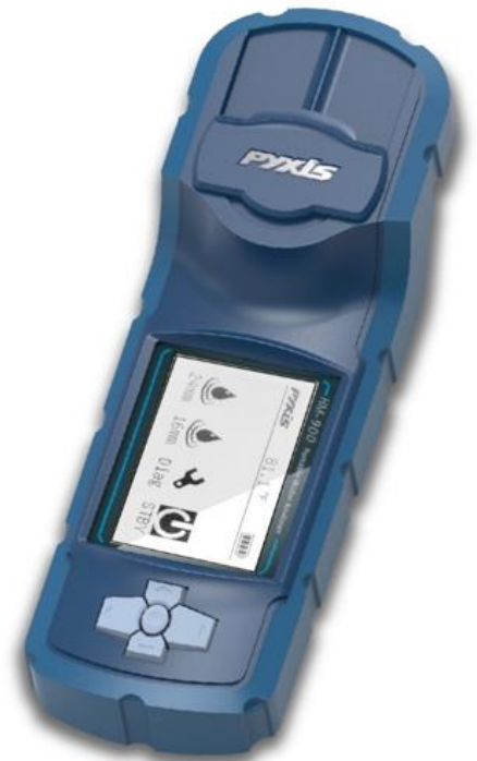
HM-900 Series Oil In Water

Secondary Standard for Rapid Calibration – Preparation of a true oil in water calibration standard is both time consuming and subject to error. As such, the HM-900 can also be calibrated using Pyxis synthetic OIW (oil in water) secondary standards. This approach enables users to utilize a synthetic oil in water standard for rapid device calibration, improved accuracy and extended shelf life of the calibration solution.