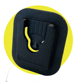
Belt Loop Dock