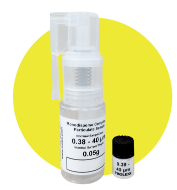
Compliance Pack ONE

The XD One Compliance Pack allows for the regular performance checking of the XD One against a supplied reference particulate range.