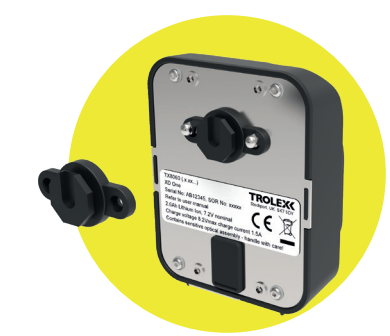
Klick Fast Stud