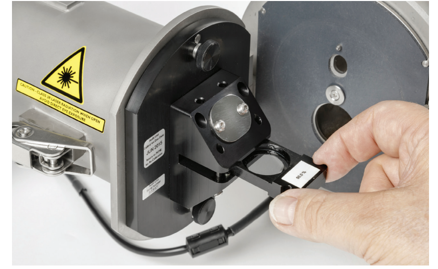
PCME QAL 260 shown with a multi-value Manual Audit Unit and attenuator

The automatic contamination check system (patent pending) ensures that any optical variances are measured, defined and adjusted to ensure zero and span drift is kept to a minimum.