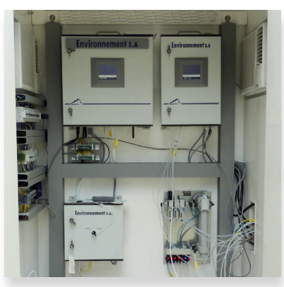
MIR 9000 CLD with the multiplexing system MVS