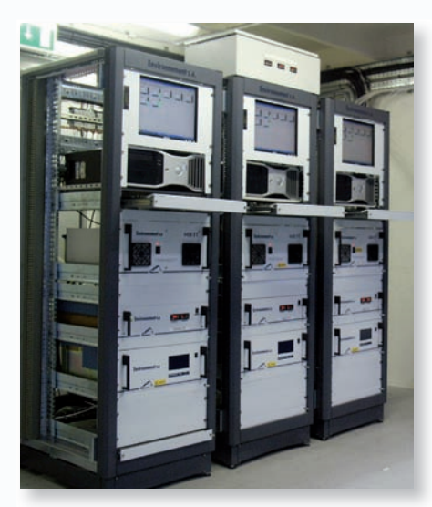
MIR FT rack cabinet