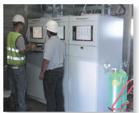
MIR FT mounted in air conditioned enclosure

With the emissions limits tightening and new gases being introduced, this instrument allows future gas upgrades, providing the solution for today and what may happen tomorrow. Designed to operate under legislation such as 2000/76/EC (WID) and 2001/80/EC (LCPD), The MIR-FT offers maximum availability and complete compliance with QAL 1 of EN14181 & EN15267-3.