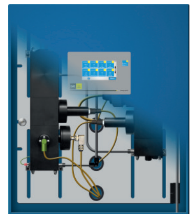
Art. no. 487 0000