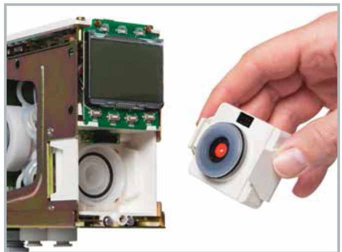
Midas Gas Detector plug-and-play sensor cartridge allows quick and easy sensor replacement