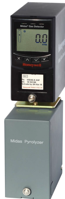
Midas Gas Detector with Midas Pyrolyzer