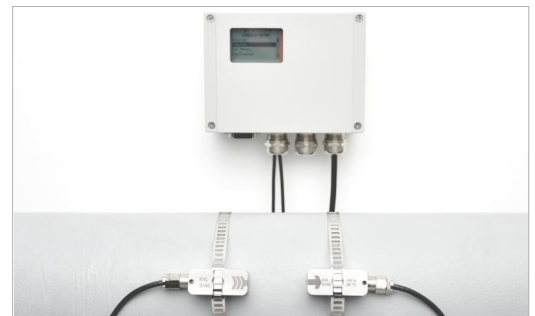
The KATflow 100 was supplied as an energy meter to the hospital